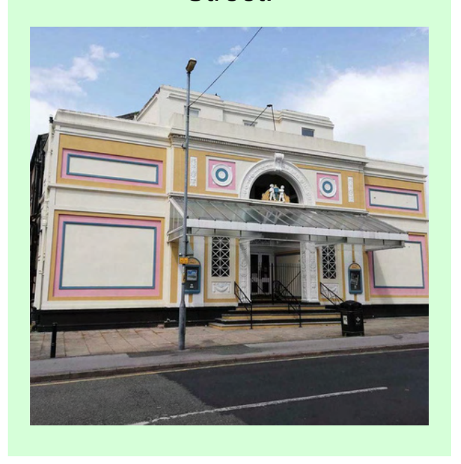
Through the Town Centre .